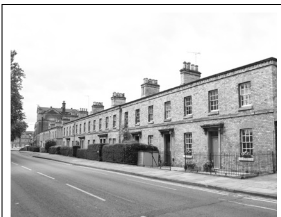
The once derelict and now restored cottages on Railway Terrace.