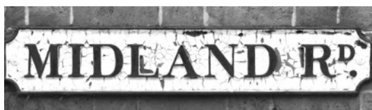
The well-known Midland Road street sign on the exterior of the Midland Hotel.