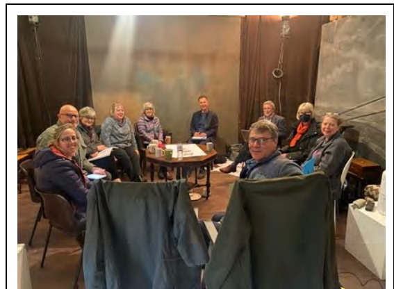
The recent workshop in the studio held with the consultants from Innes Associates.

They are challenging us and questioning everything, which is great and will result, we hope, in a robust forward plan. The whole team is working hard to this end.