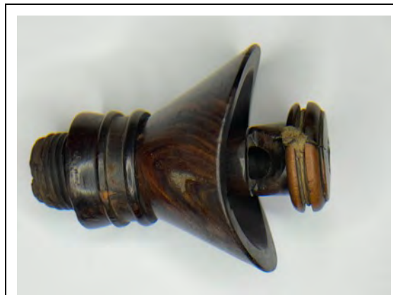
The original Victorian Lignum Vitae mouthpiece for the speaking tube.

We still have a lot to discover and are hoping to be able to trace the route of the pipe and learn more about the workings of such systems.