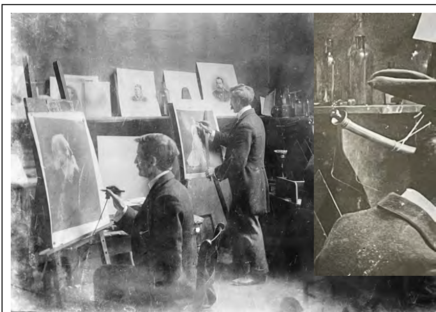
The well-known photograph of the Retouching Room, with a close-up of the speaking tube.

We continue to find out things about the building and recently, looking at a picture of the Retouching Room, noticed a 'speaking tube'. Although this is a well-known image, it had never been spotted before!